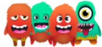
St Ives House